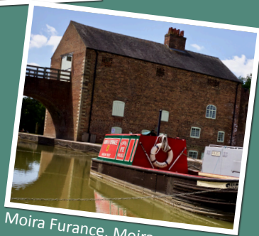
Moira Furance, Moira

For more information visit www.nwleics.gov.uk/helloheritage www.southderbyshire.gov.uk/helloheritage