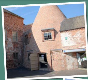
Sharpe's Pottery, Swadlincote